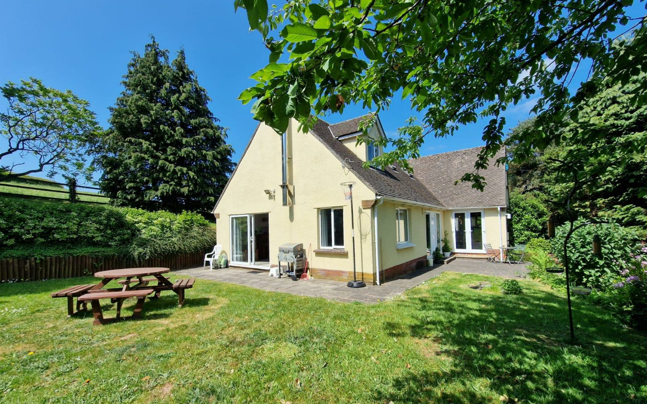
Farleigh House Rackenford Road, Tiverton, EX16 5AF £1,995 PCM